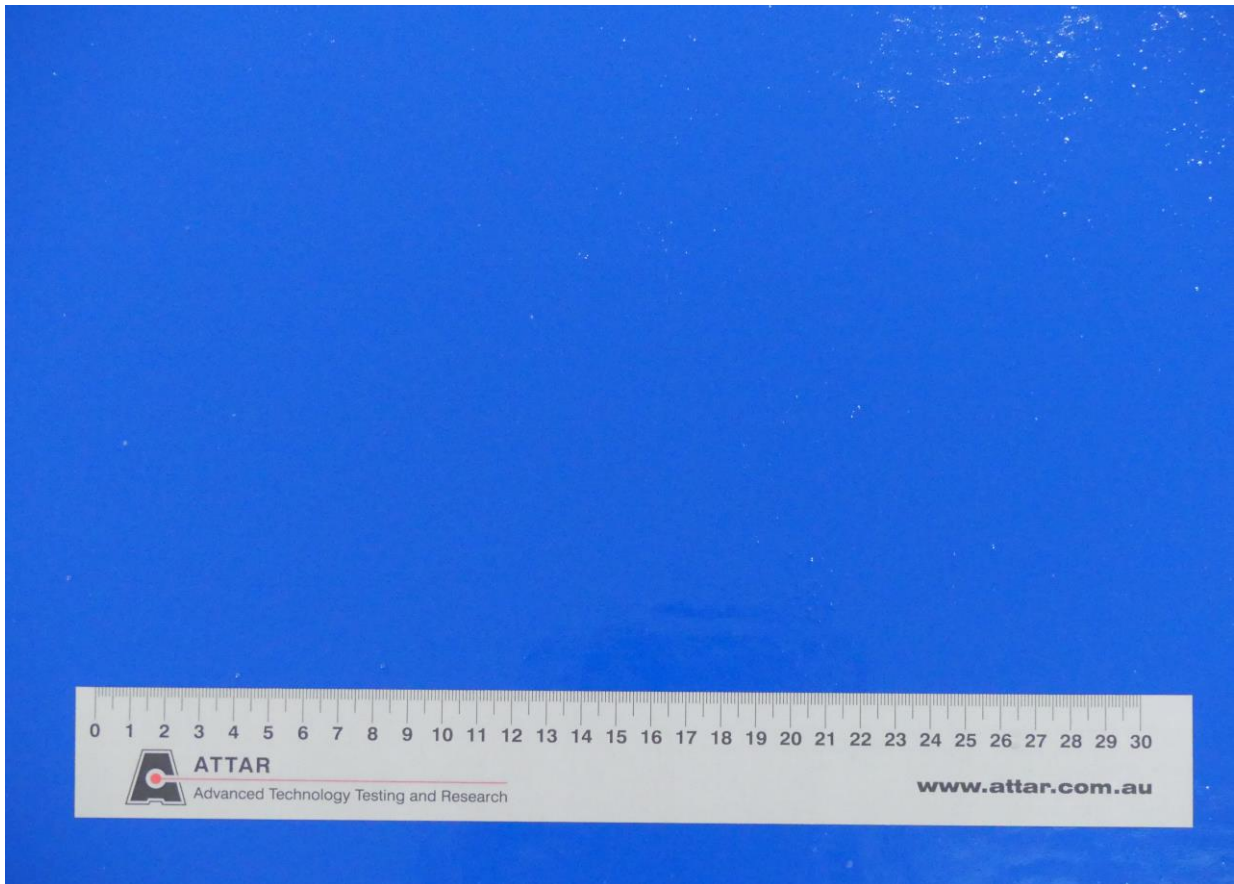
Figure 1: Dulux Avista Polyaspartic Sealer