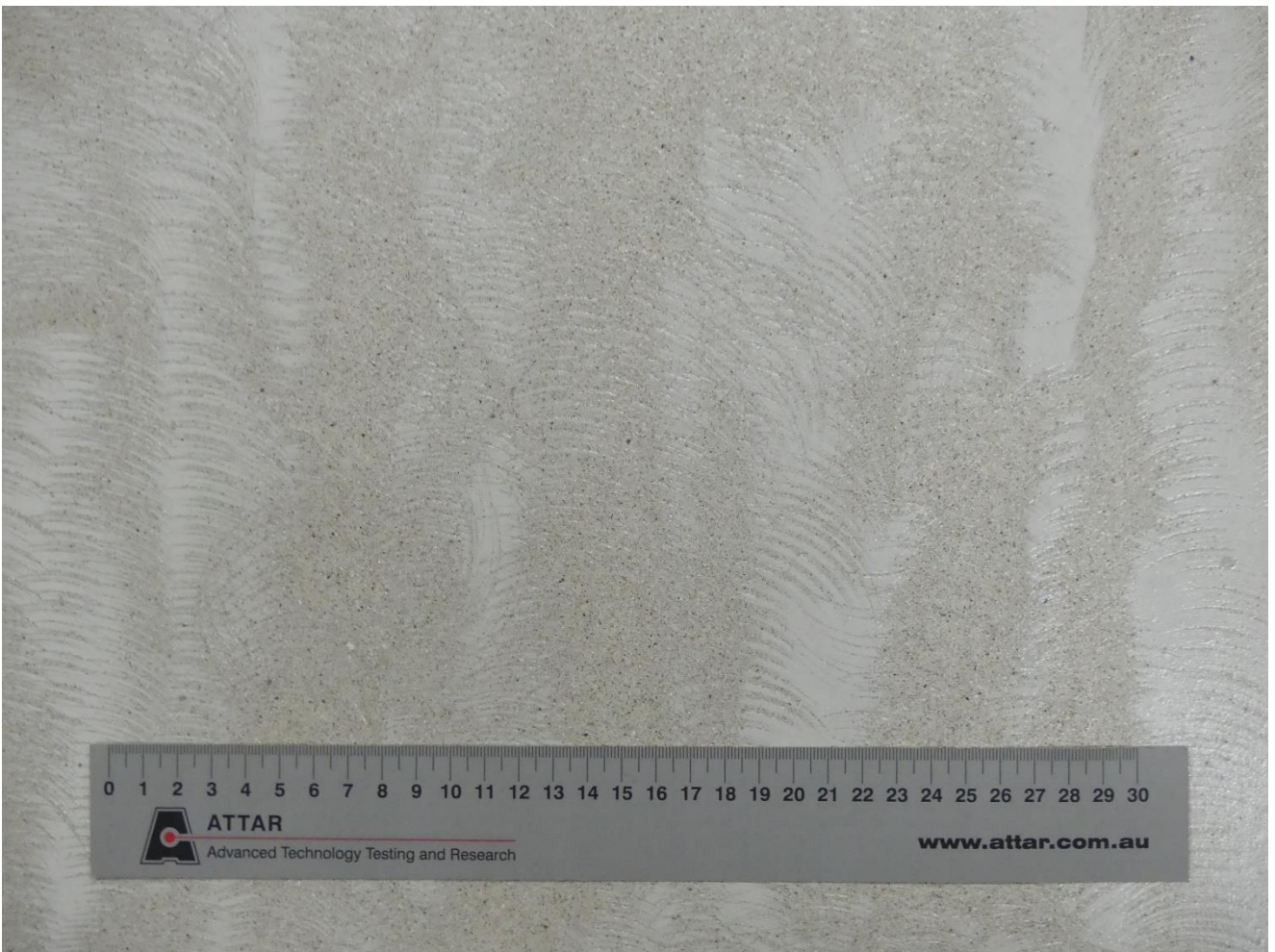
Figure 1: Dulux Avista Waterbased Sealer with Slip Reducing Additive applied to steel trowel finish concrete.