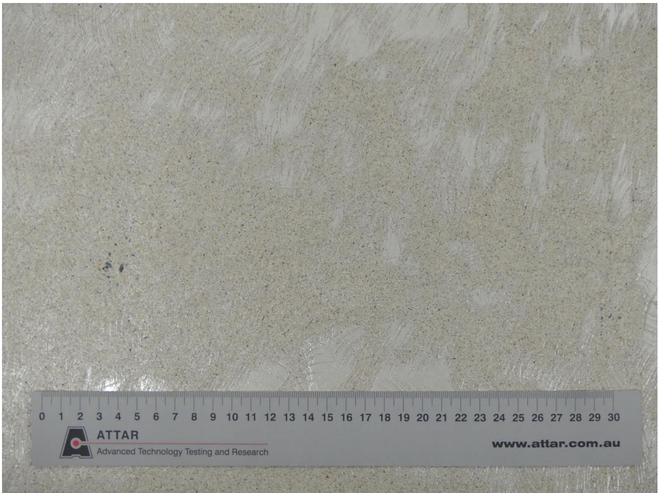
Figure 1: Dulux Avista 2 Pack Urethane Sealer with Slip Reducing Additive applied to steel trowel finish concrete.